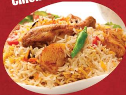
Chicken Dum Biryani