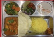
Chicken Curry Combo